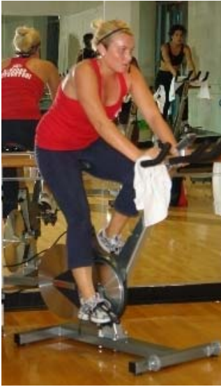
Try-Out a aero- dynamic spinning bike in any of the TEN GroupX classes offered this semester.